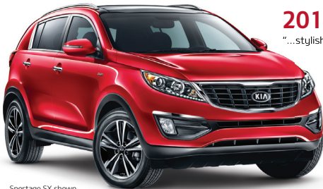
Sportage SX shown. msrp $24,260 EKES0, EKE462.