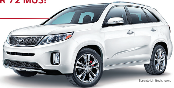
Sorento Limited shown.

Overall 5-Star Crash Safety Rating for the 2015 Sorento 4