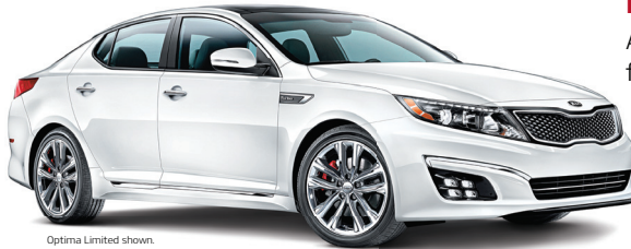
Optima Limited shown.